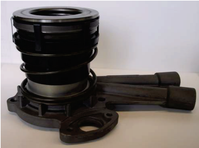
Fig. 1: 3182 998 501 w/o travel sensor