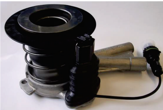
Fig. 3: 3182 600 101 with travel sensor