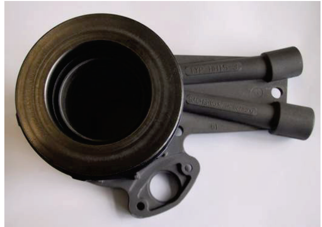
Fig. 2: 3182 998 501 w/o travel sensor